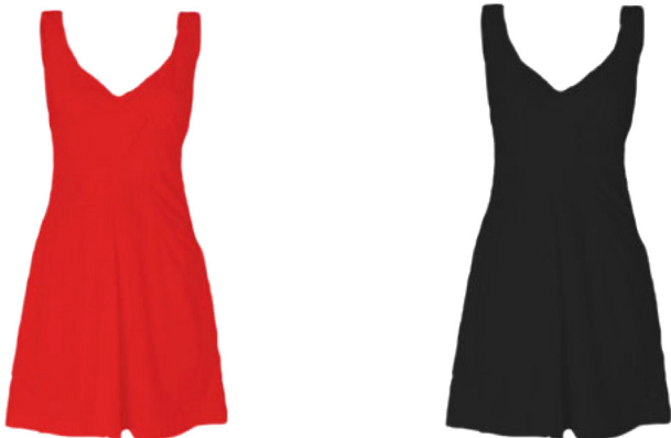
Fig. 1. Red and black versions of the dress used in the scenarios.

We took a photograph of a white knee-length dress and applied a color mask using Adobe Photoshop CS2. Separate red and black versions of the dress were created, ensuring that the pictures were identical aside from color (see Fig. 1).